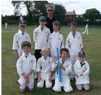
Under 9s Festival Swindon

If you do have any questions or comments, please do feel free to contact me directly at rob@shillaker.net or home: 01249 714160 mobile: 07990 524363